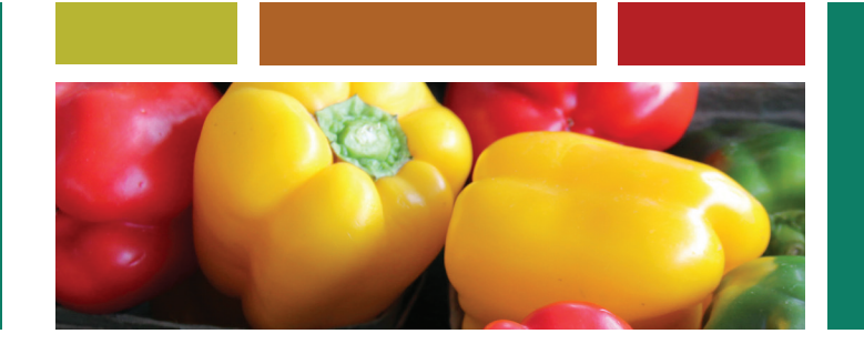
Save up to 40% on groceries!