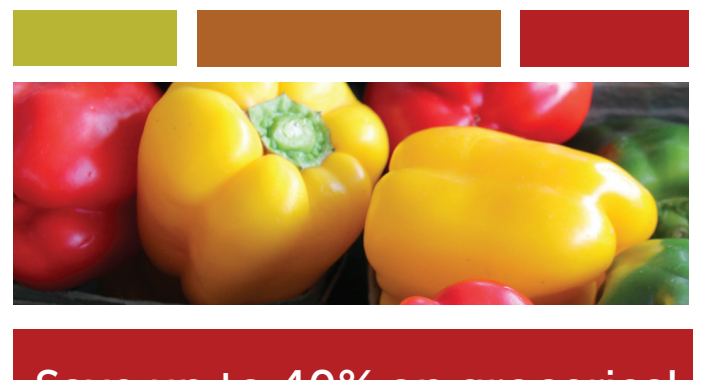
Save up to 40% on groceries!